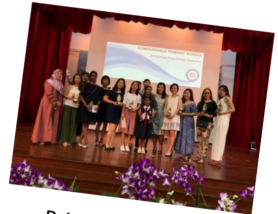
Prize-Giving Day (Nov)