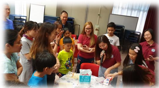
PV Connect (Sept)