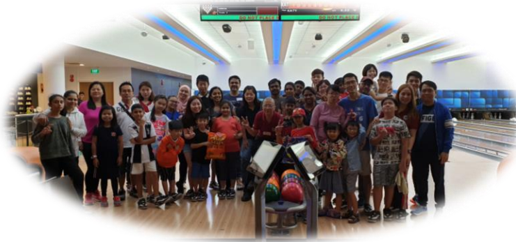
PVs Day Outing (June)