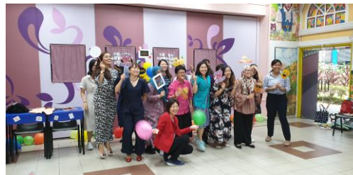
Teacher's Day Celebration (Sept)